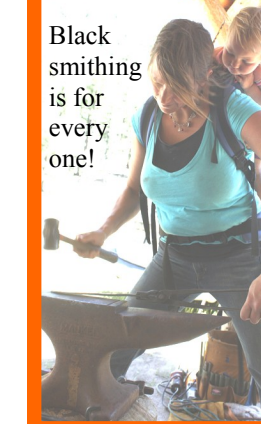
Black smithing is for every one!